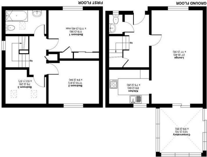
Tircoed Forest Village, Penllergaer, Swansea, SA4 Approximate Area = 979 sq ft / 90.9 sq m For identification only - Not to scale

Floor plan produced in accordance with RICS Property Measurement 2nd Edition. Produced for Dawson's Property, REF: 121043.